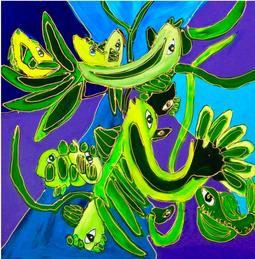
Fishgreen - Heidi Arbouw - acrylic on canvas - 100 x 100 cm