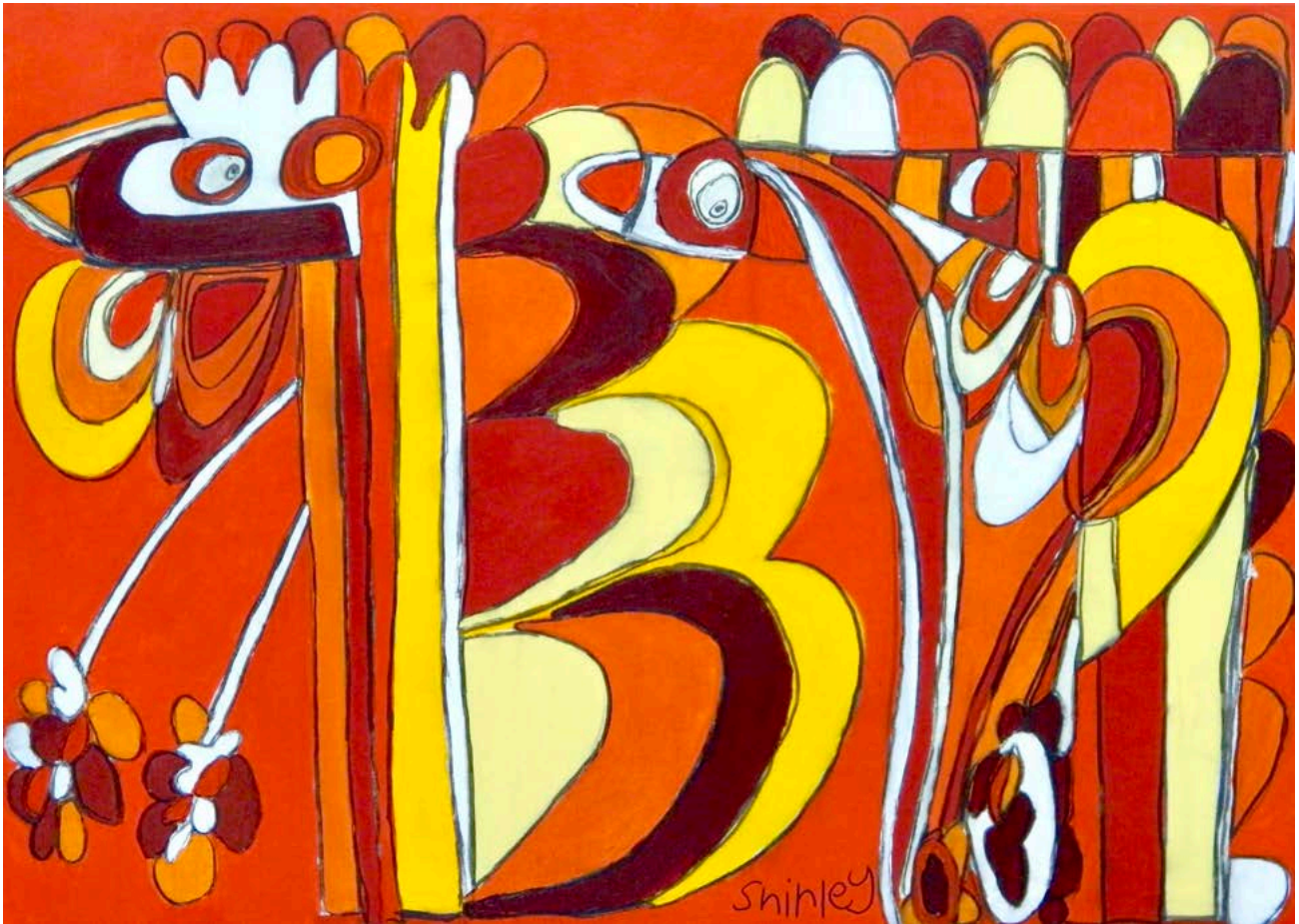
Chickenfriendship - Shirley van Steen - acrylic on canvas - 100 x 140 cm