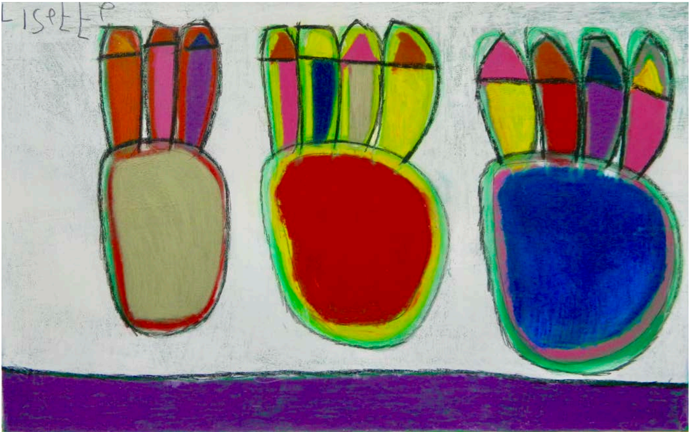
Trees - Lisette Koppejan - acrylic on canvas - 100 x 160 cm