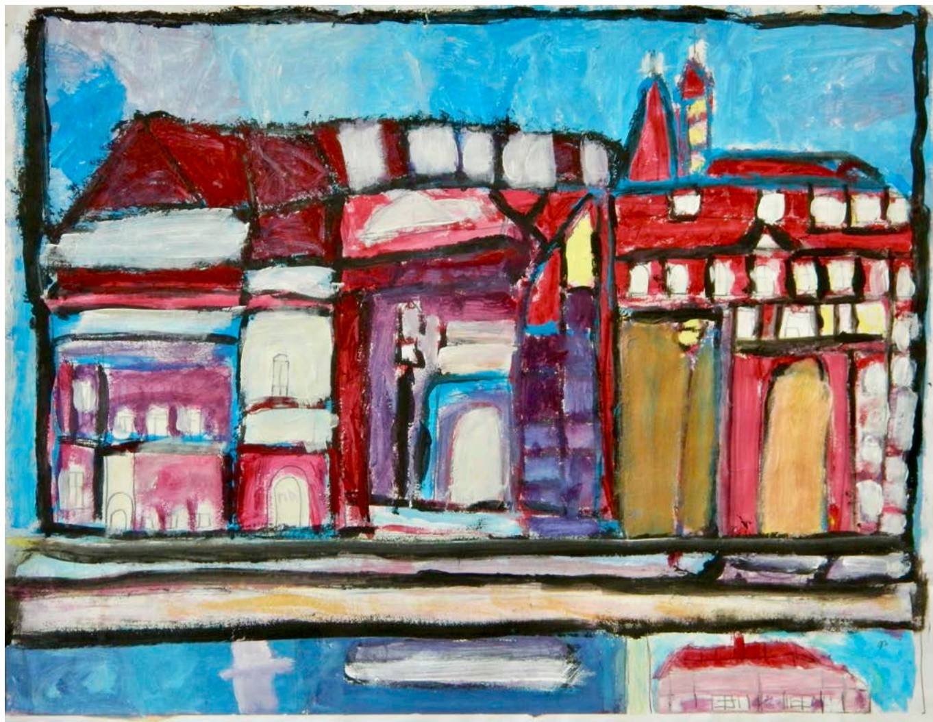
Without titel - Frits Heukenshove - mixed technique on paper - 70 x 90 cm